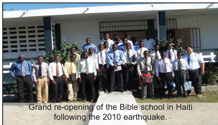
Grand re-opening of the Bible school in Haiti following the 2010 earthquake.